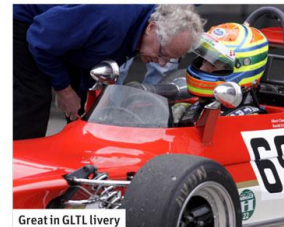
Great in GLTL livery