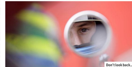
Don't look back...

MAKE/MODEL/YEAR: LOTUS/69/1971 CHASSIS: Tubular steel, alloy panelled DESIGNER: David Baldwin ENGINE: Lotus LF 4-cylinder twin-cam 1594cc POWER OUTPUT: 125bhp (21.5mm air restrictor) GEARBOX: Hewland Mk8, 5-speed, LSD