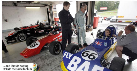
...and Sims is hoping it'll do the same for him

"It reacted properly and it's the first one in which I've really felt the aero – it gives you a bit more confidence."