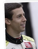
'Seat belts? Yes please'

"If the whole day had been just for those five laps it would've been worth it," he says with a grin. "The first thing the owner said to me was, 'Do you want seatbelts?' I said, 'Yes please!' It's ridiculous! I can't believe this is actually what they used to drive. I can't believe how small the tyres are – they're smaller than cadet kart tyres! The wheels wobble by 5cm and when you go round a corner you have to put your elbow out!"