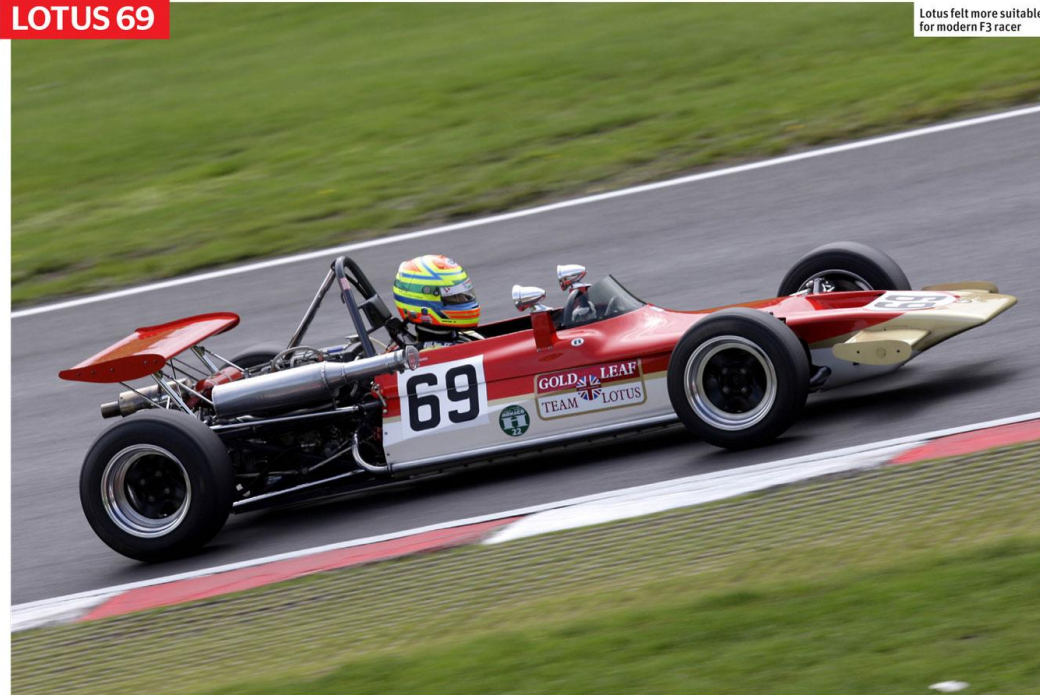
Lotus felt more suitable for modern F3 racer

Lotus's Type 69 nomenclature in 1971 is confusing, for David Baldwin's designs covered Formula 2, Atlantic/FB, F3 and FF1600 derivatives, the most senior versions using sheet-alloy monocoque chassis, the junior ones tubular-steel spaceframes. Gold Leaf Team Lotus, the factory equipe, was very much at the forefront of F3 in Britain and Europe at the time.