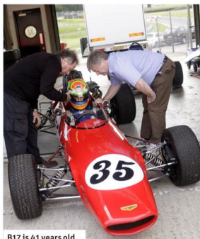
B17 is 41 years old...

TECH SPEC MAKE/MODEL/YEAR: CHEVRON/B17/1970 CHASSIS: Tubular steel, sheet steel panelled DESIGNER: Derek Bennett ENGINE: Ford Holbay R70 MAE 4-cylinder 997cc POWER OUTPUT: 110bhp GEARBOX: Hewland Mk8, 4-speed