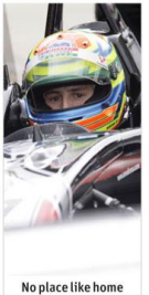
No place like home