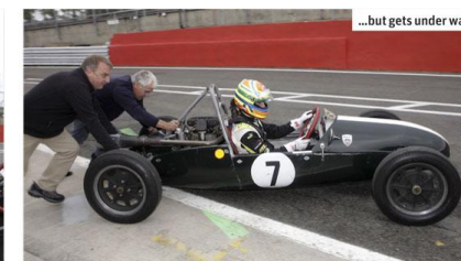
...but gets under way