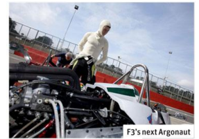
F3's next Argonaut