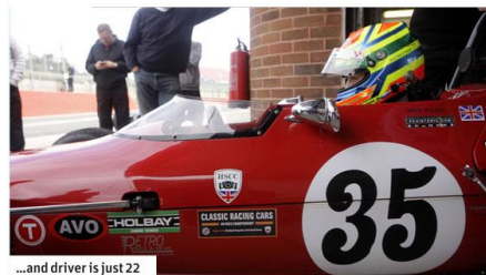
...and driver is just 22

This led to Avon increasing the diameter of the front tyres by 20mm. Since then, as downforce levels have increased with each new generation of chassis, the rubber has been adapted further to cope with higher loads.